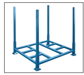
Model RL414 w/4 Model RL421