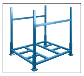
Model RL414 w/2 Model RL419