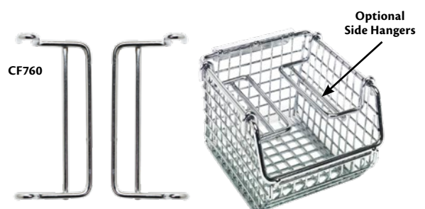
Optional Side Hangers