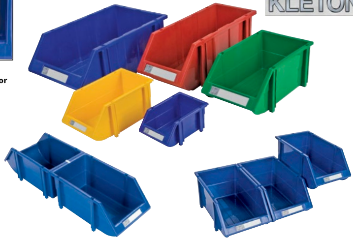
Connector clip allows for back-to-back mounting