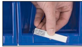
Inclined faceplate with removable label and protector