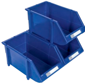
Stackable using built-in feet